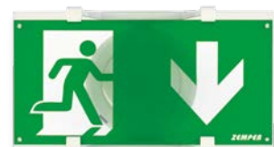
ALP0011 Signalling surface wall