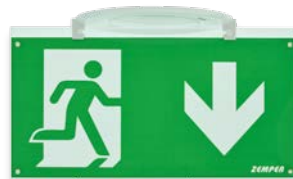
ALB0011 Signalling with recessed round frame