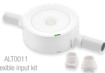
ALT0011 Flexible input kit for surface pipe