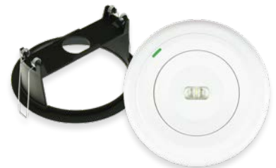
ALC0011 Round recessed frame