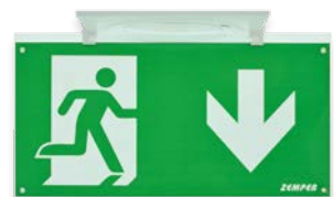
ALX0011 Signalling with recessed squared frame