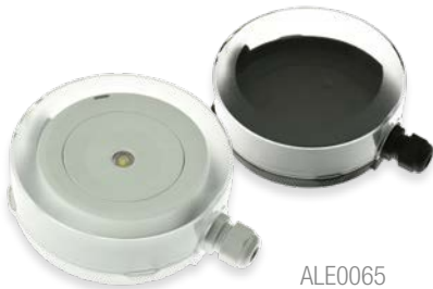
ALE0065 Kit IP65