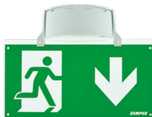
ALS0011 Signalling surface ceiling