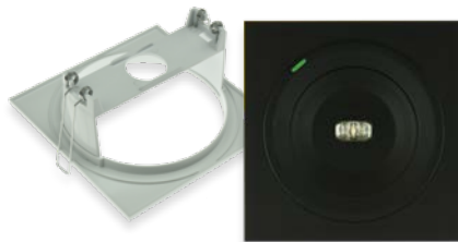
ALQ0011 Square recessed frame