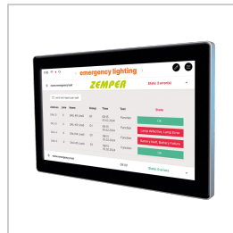
ZWEBDALI2 CENTRAL DALI2