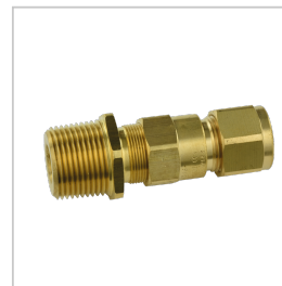
PSA001 ACC. CABLE GLANDS SATURNO