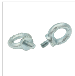
CAM001 RING BOLT FOR PENDANT MOUNTING