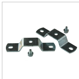
BRD001 ACC. FIXATION FLANGE SATURNO