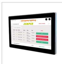
ZWEBDALI2 CENTRAL DALI2