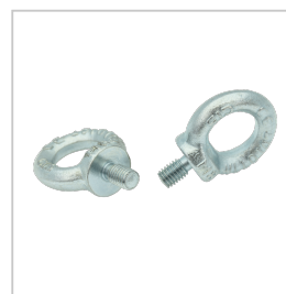
CAM001 RING BOLT FOR PENDANT MOUNTING