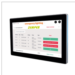
ZWEBDALI2 CENTRAL DALI2