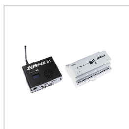
CSZ003 SMARTZ CONTROL UNIT+ UPS CSZ002+SAI002