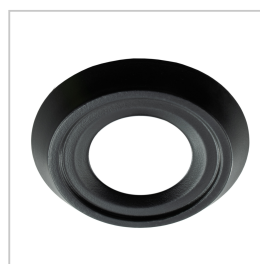
ACE0065N ACC. IP65 SPACE BLACK