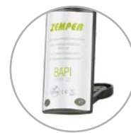
Stand for hands free use on flat surface