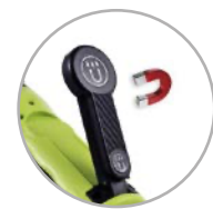
Magnet for metallic surface fixing